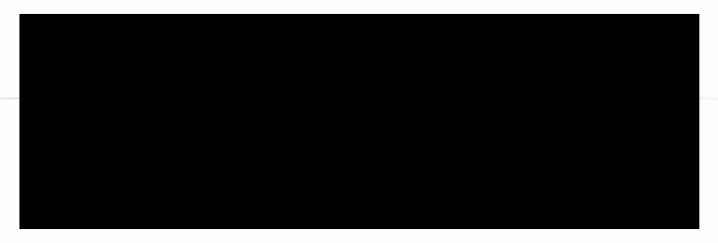
(Continue on page 6 if necessary)